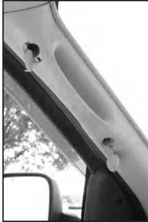
Dodge Ram Shown (Photo 1)