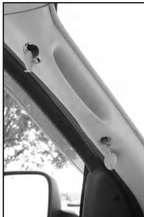
Dodge Ram Shown (Photo 1)