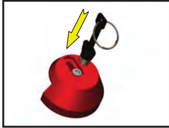
- Align the Secure Key over the screw head and slip it on.