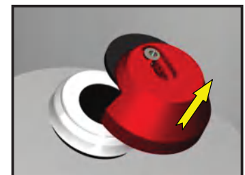
- Remove the Shel-Loc(TM) from the filler neck.

Lightly tightening the Secure Screw is enough to ensure a secure system and an easy-to-unlock cap for the future.