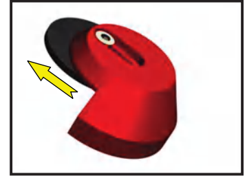
- Slide the black cap piece outward as pictured.