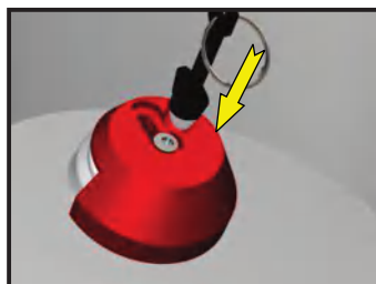
- Align the Secure Key over the screw head and slip it on.