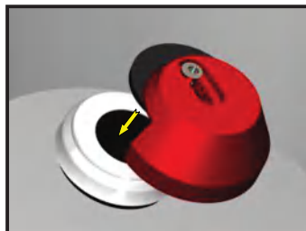
- Set the black cap piece on top of the filler neck shield, aligning the bottom protrusion onto the relieved flapper.