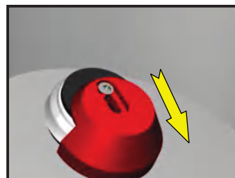
- Slide the red shell off of the black cap piece.