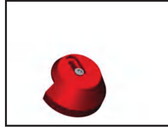
- Remove Secure Key.