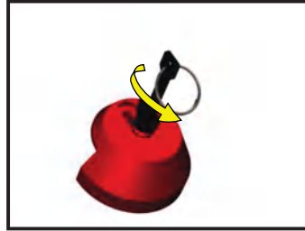
- Turn the Secure Key counterclockwise about one revolution raising the head of the Secure Screw above the locking pocket.