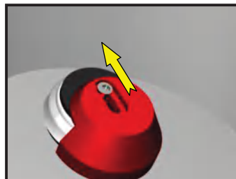
- Slide the red shell over the black cap piece.