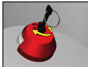
- Reinstall the Secure Key on the head of the screw. Turn the Secure Key clockwise until the screw is lightly tight.