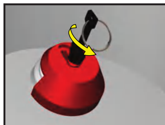
- Turn the Secure Key counterclockwise about one revolution so that head of screw is above the locking pocket in the top.