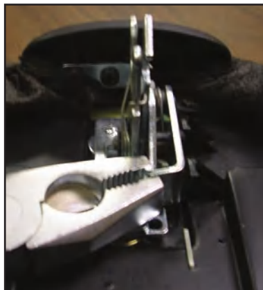
Bend with pliers