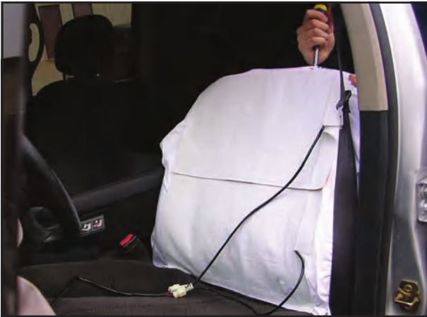
T-shirt, heater element for the seat back.

First, find a scrap t-shirt. Attach the heater elements to the t-shirt. Drape the t-shirt over your existing seats using the head rest holes to keep the t-shirt in place on the seat back and a good tuck-fit to keep the t-shirt in place on the front of the seat bottom.