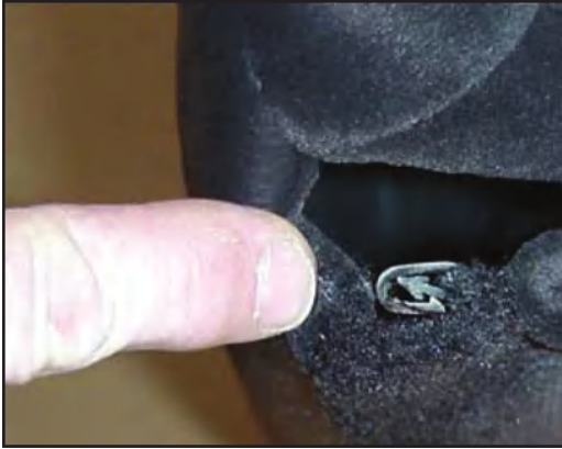
The seat cover J-Clips.

Next, unlatch the J-Clips that attach the seat back cover together.