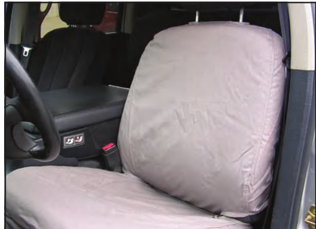
Seat cover installed over the heater elements on the back and bottom of the seat.

Next, make a trip to the local Auto Boys/Pep Zone (or mail order for a matching fit) and purchase some accessory seat covers.