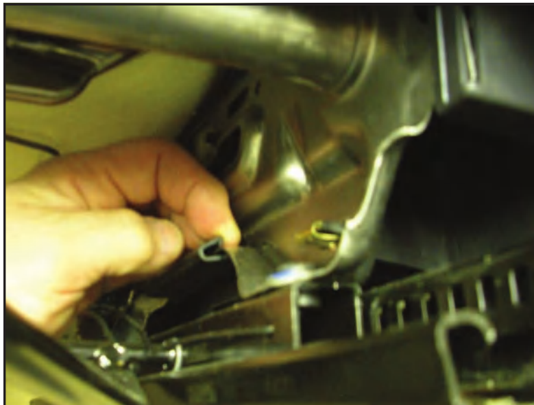
Remove the seat cover by pushing the J-Clip away from the metal edge of the seat's bottom.

Removal is the same as the '94-'09 seat covers—there are J-Clips along each side of the cover. However, you do not need to release all four sides of the cover, only the front J-Clip and the next-to-console side J-Clip.