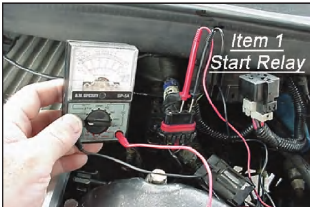
No voltage for "START" tells you to check the Start Relay to the solenoid (Item 1).

So, we presented a tip to get you to a desired location. Does the "no start" problem lie with the solenoid, the relay to the solenoid, the fusible link that feeds the solenoid or a fuse?