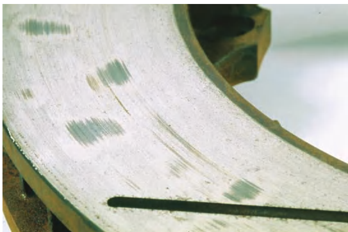
A rotor which has been exposed to an overheated brake pad. Note the friction material deposits on the face.

First, make absolutely sure to cool your brakes after extreme use (and NEVER stop while they are hot with your foot still on the brake pedal)! Anytime hot brakes are allowed to sit motionless, molecular bonds may continue to form between the brake pad and the existing transfer layer material (adherent friction in action). The result is nearly instantaneous TV generation.