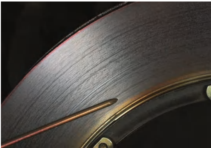
A typical rotor after bed-in. The soft gray haze on the rotor face is the transfer layer material.

Once the brakes have faded a bit and/or you smell friction material in the passenger compartment, the cycle is complete and you should allow the system to cool by driving at steady speeds without bringing the truck to a complete stop. After cooling, repeat the braking event procedure listed above one more time, cool down again, and you're typically good to go. In some situations a third cycle is beneficial, but two are usually sufficient.