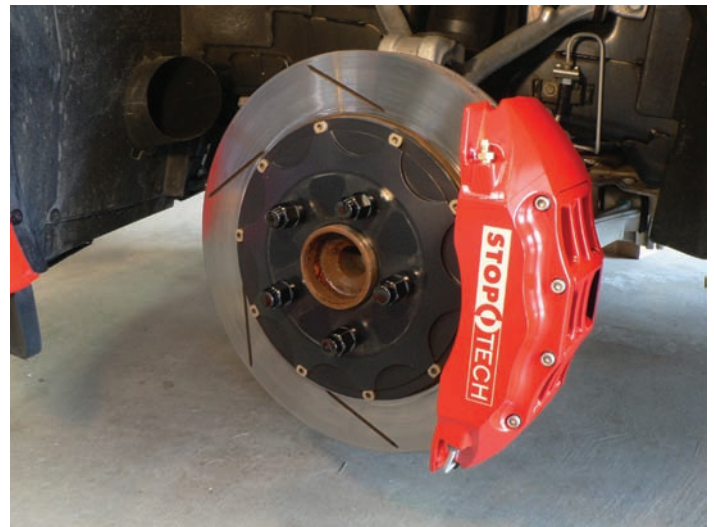
Regardless of how large, colorful, or sexy your braking system components, it's still the tires that stop the truck!

No tire traction, no tire force, no deceleration. Hello, tree. Thud!