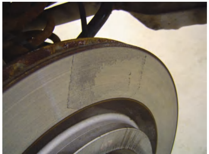
Pad printing is due to corrosion while parked. This is classic TV in the making, and pulsation is only a few miles away.

TV is generally created in one of three ways. The least glamorous, yet most common form of TV is initiated when a truck is parked in the same place for an extended period of time. While it is sitting, a thin layer of corrosion (ferrous oxide, or rust) can form between the brake pad surface and the rotor. As you can probably imagine, sitting in humid or damp environments can greatly accelerate the corrosion.