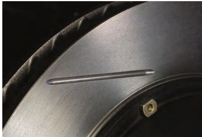
A typical rotor before bed-in. Note the clearly defined machining marks on the rotor face.

The process of developing a transfer layer is typically referred to as brake pad bed-in (or more commonly known as break-in). In general, bed-in consists of heating a brake system to its adherent temperature to allow the formation of a transfer layer. The brake system is then allowed to cool without coming to rest, resulting in an even transfer layer deposition around the rotor circumference. This procedure is typically repeated two or three times in order to ensure that the entire rotor face is evenly covered with brake pad material.