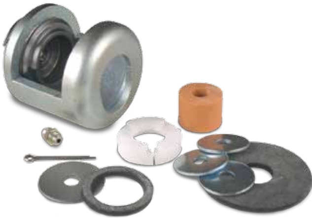
The Luke's Link replacement ball stud parts.

So what is the solution? Luke's Link of Colorado offers a permanent solution to Dodge pickup tracking problems. At Luke's Link our line (technically speaking, a ball stud socket collar) was designed to rebuild and convert track bars to a fully adjustable end. With this kit, you remove the ball stud and internal parts and slide a cap or C-clamp over the end. You then install the new modified internal parts with the new modified spring being the main component. Then a large plug screws into the cap to tighten everything down. With this setup, the ball joint will never wear out. If it does, you can adjust it by unscrewing the plug and putting a spacer under the plug to shim the spring down. This only takes a few minutes to adjust. This allows the track bar assembly to last for the life of the truck.