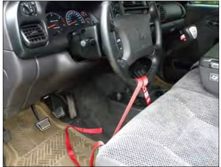
This technique makes the steering stay put while you work which avoids clock spring damage.

To fix one of these issues I decided to replace the bearing in the bottom of the steering column with the bushing offered by http://rocksolidramtrucksteering.com . The instructions supplied with the kit were very straightforward and it appears to be somewhat easier to do on my truck given it is a manual rather than the automatic trucks with the column gear selector. One note worth mentioning here is that any time you uncouple the steering system, the steering wheel is free to turn inside the cab. This must not be allowed to happen as it may bring about the destruction of the “clock spring” inside the column. The clock spring is actually a thin ribbon cable type electrical connection between the portion of the column that rotates and the part that doesn’t rotate. The catch here is that the cable or clock spring is a fixed length so if you connect the steering back up in a different orientation than it currently is, you may run out of cable when turning left or right. The best way to avoid this is to put the truck’s front wheels straight ahead prior to disassembly. Then take a cargo strap and attach it to one of the driver’s seat floor supports, thread it through the steering wheel and connect to the other seat support as shown below: