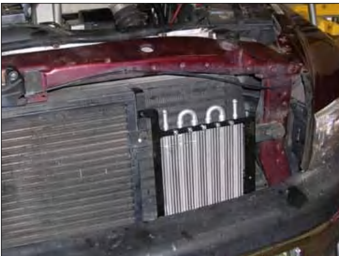
An automatic transmission fluid cooler in its new job as a power steering fluid cooler.

One problem became readily apparent when I removed the power steering hydraulic hoses. My power steering fluid smelled burned and was unnaturally dark in color. I then decided to take the power steering pump off and check the condition of the pump. This observation fit with the extremely high temperature of the hose fittings near the hydraulic brake assist unit I have observed over the life of the truck. I decided to do something about high temperature of the power steering fluid. So I found an automatic transmission fluid cooler that would fit on the driver's side of the air conditioning condenser in front of the intercooler. I designed a bracket and mounted the cooler in line in the return hose from the steering gear box back to the power steering pump reservoir.