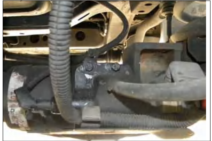
Spline engagement housing on back side of front axle.

Once removed simply put the collar on the intermediate shaft while reinstalling the passenger side half shaft. Then position the collar on the spline so that the actuator fork engages the collar and you can bolt up the actuator/housing cover. I recommend removing the spline engagement housing cover anyway to wipe the old differential lube and crud out of the sump.