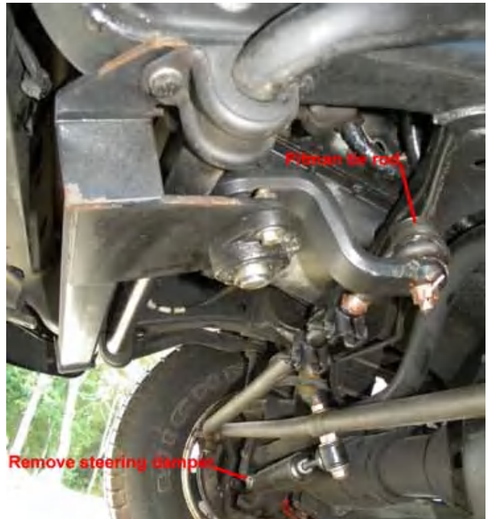
Remove steering damper.

With the brake rotors off both sides, this is a great time to break this project down into two projects: tie rod ends and ball joints.