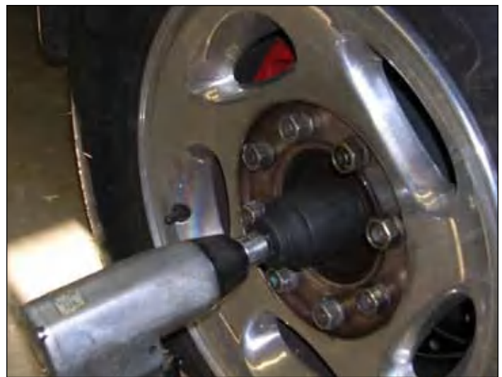
My old Chicago Pneumatic 1/2" impact wrench having a go with a 3/4" socket adapter and 1 11/16" socket. Both nuts are standard clockwise tighten so remember patience and penetrating oil. My impact wrench took about 20 seconds per side and the nuts were off.

Before you put the truck up on the four jack stands, remove the hub caps and take the half shaft hub nuts off. This requires first removing the cotter pins and then a 1 11/16" socket. Penetrating oil and patience are important components for this phase of the project. In my experience the best penetrating oil you can get is mixture of 50% acetone and 50% automatic transmission fluid. One word of caution is that the penetrating oil isn't friendly to the clear coat on your aluminum wheels, so caution with runoff is necessary. However, repeated application of penetrating oil over a week's time prior to disassembly will make the job go much easier, especially with the bearing hubs.